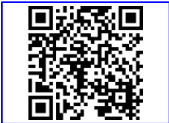
Sponsor a VFW Post Event