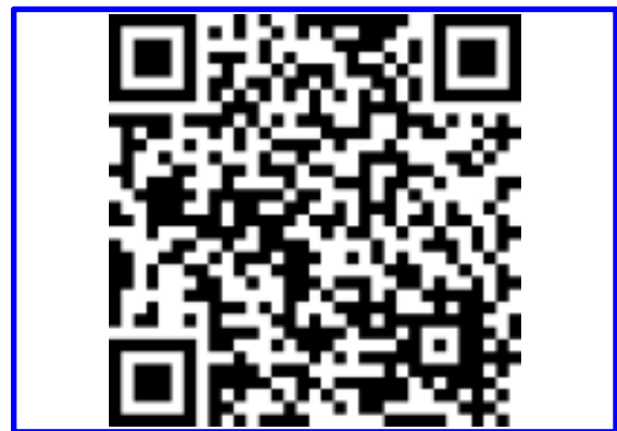
Renew Your Membership