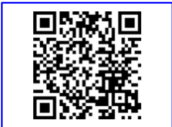
Help Us Buy a Point of Sale System for the Canteen